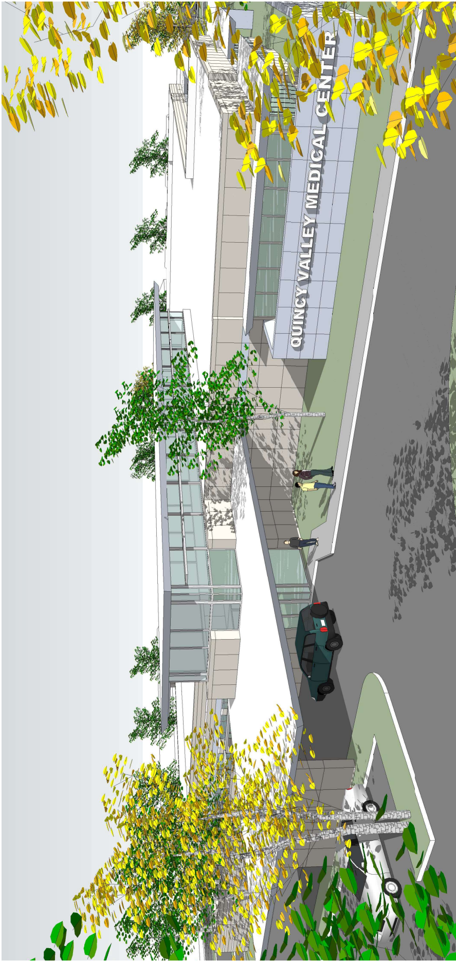
View - SW Aerial