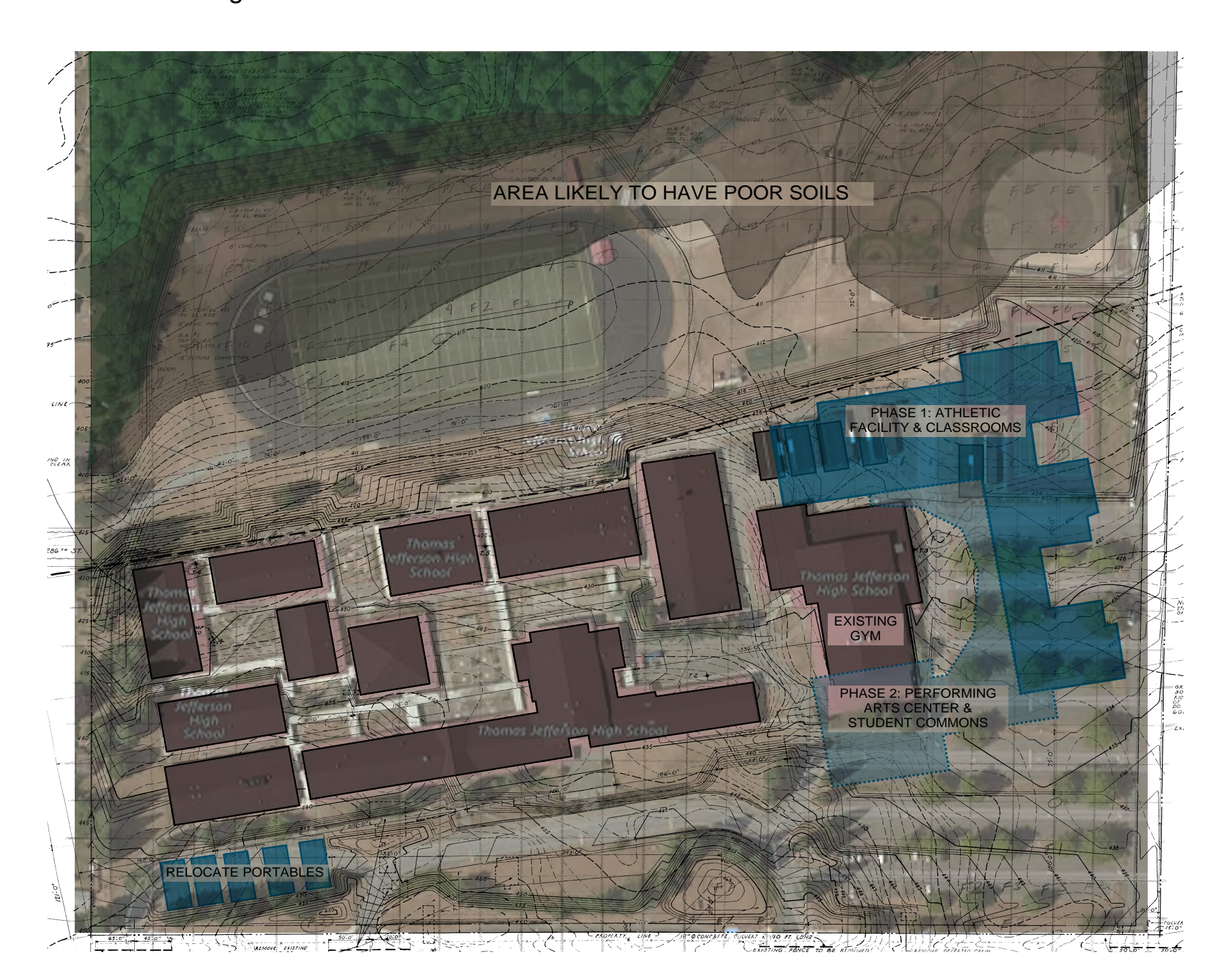
EXHIBIT E: CONCEPT SITE PLAN Thomas Jefferson High School