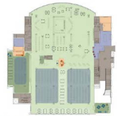
Current Second Floor space allocation