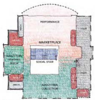
Third Floor concepts