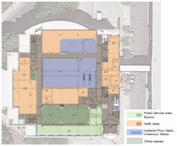
Downtown - Current First Floor space allocation