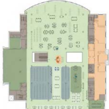
Current Third Floor space allocation