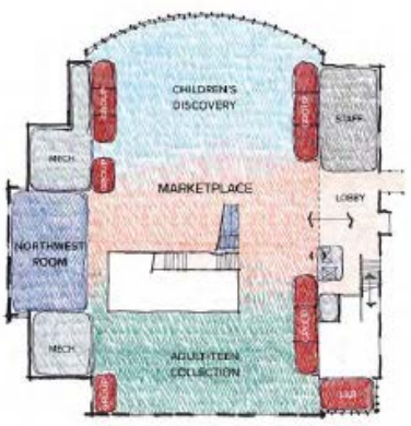
Second Floor concepts