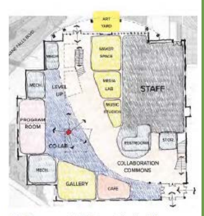
First Floor concepts for "recapturing" public space