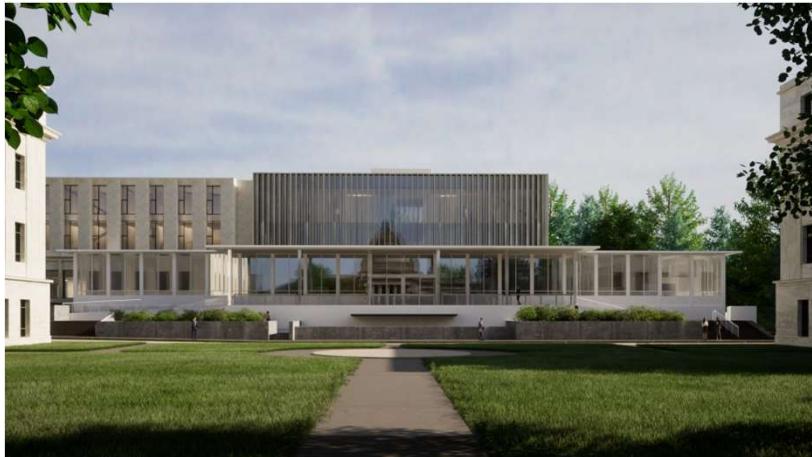
HISTORIC BOOKSTACKS – REVISED NORTH ELEVATION