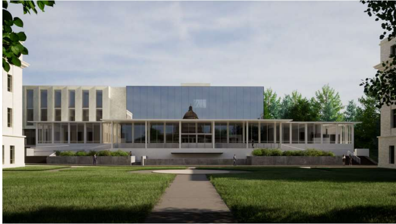
HISTORIC BOOKSTACKS – PREVIOUS DESIGN ITERATION