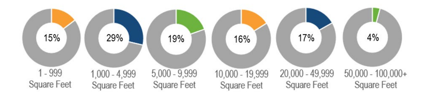
Figure 4: Distribution of Leased Space by Square Footage in FY 19