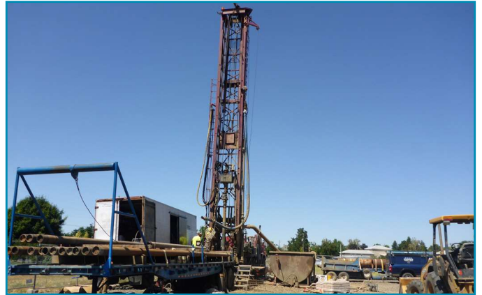
Our team recently assisted the City of College Place with Wells 4 and 6, which were both drilled in Columbia River basalts to depths of 800 feet.

and specifications to bid the project as soon as feasible to get the project on the driller's schedule. RH2 has long-standing relationships with well drillers in Washington and Oregon and has already discussed this project with specific drillers, along with potential approaches to address the challenges of minimizing cross-contamination of aquifers and optimizing well performance. Our familiarity with the likely bidders will greatly enhance project communications and working through drilling and design tasks with the selected contractor.