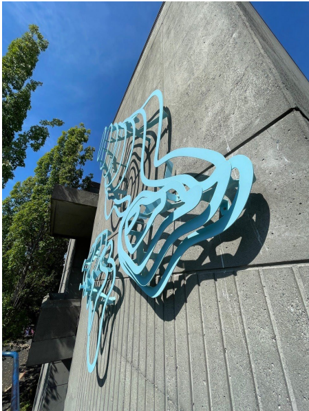
'Up / On' Kalina Chung Library Renovation North Seattle College