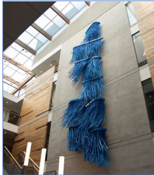
'Hydro Logic' Beliz Brother Hellen Sommers Building Capitol Campus, Olympia