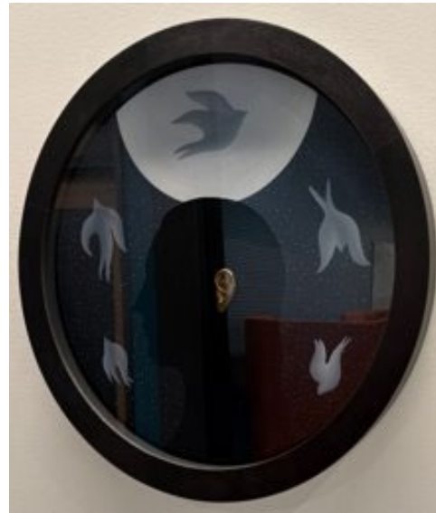
Bird Head Asia Tail