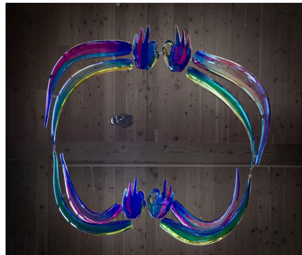
'We Belong' Orlosky Studio New Academic Building School for the Deaf