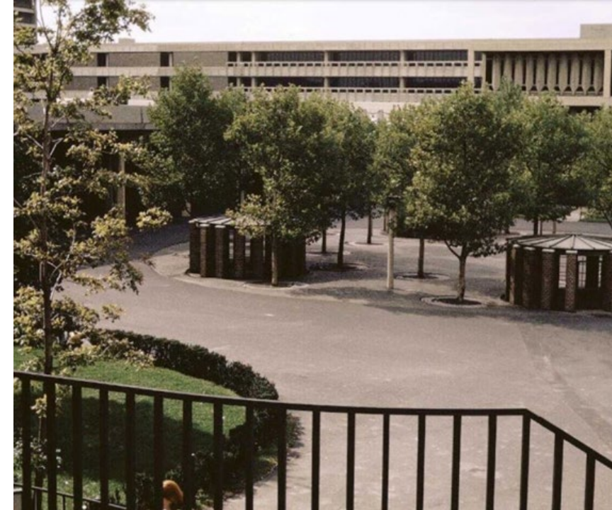
Projects Win Design Awards