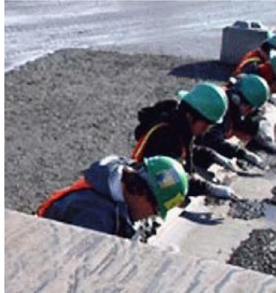
Searching for artifacts at Tse-whit-zen, Port Angeles, 2004