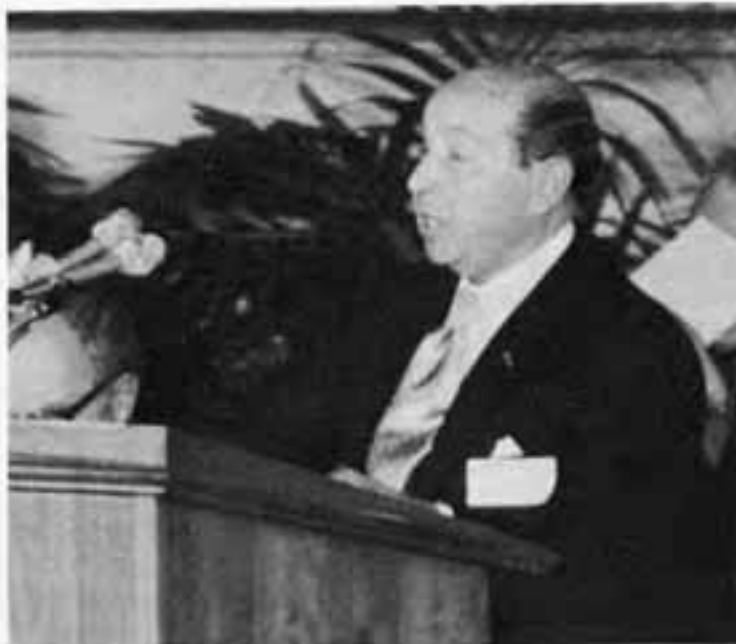
Felix de Weldon, sculptor