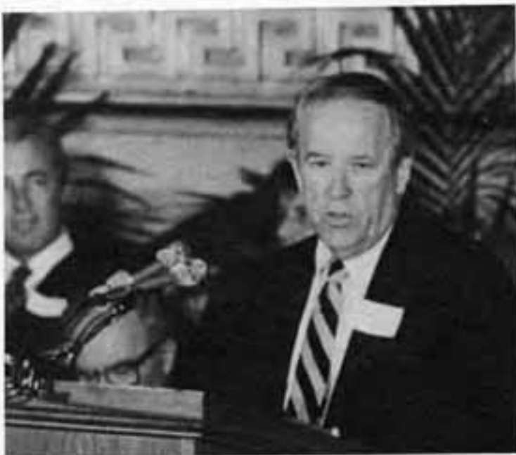
The Honorable Henry M. Jackson, United States Senator