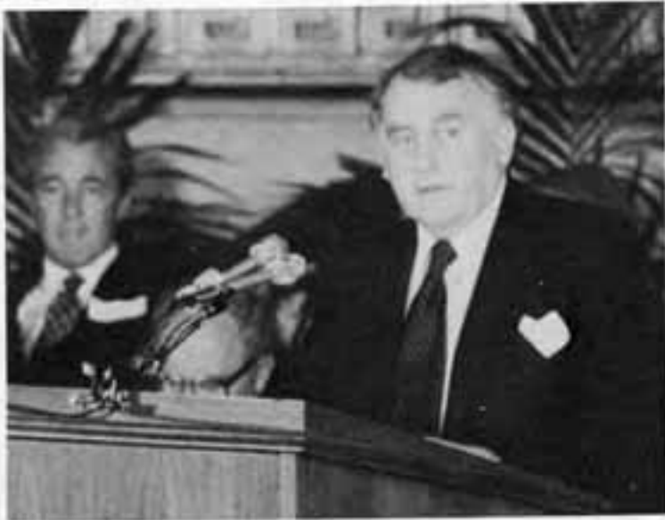
The Honorable Ray Perrault, Leader of the Canadian Senate