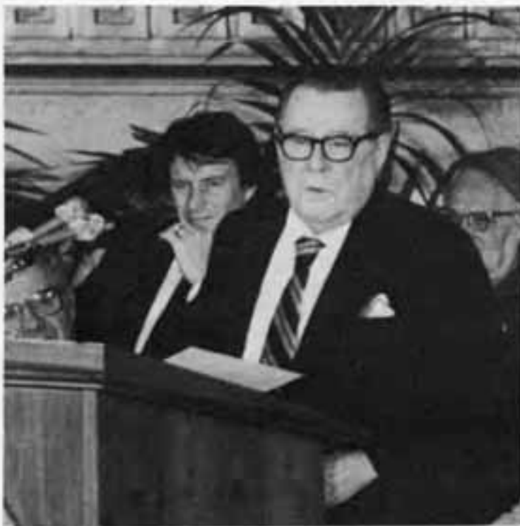
The Honorable Warren G. Magnuson, President Pro Tempore, United States Senate