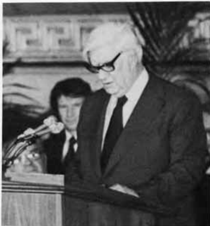
The Honorable Thomas P. O'Neill, Speaker, United States House of Representatives