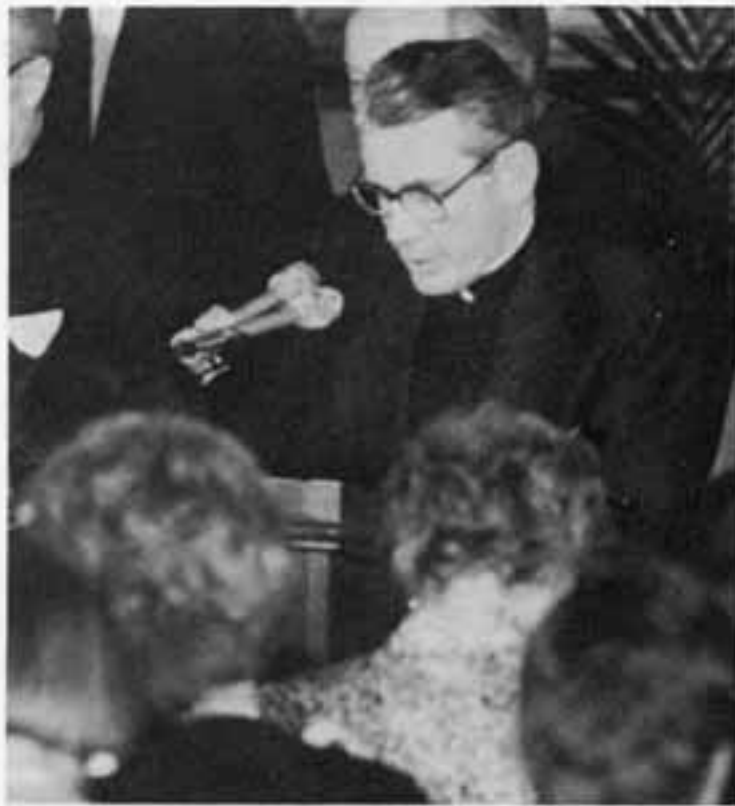
Most Reverend Timothy Cardinal Manning, Archbishop of Los Angeles