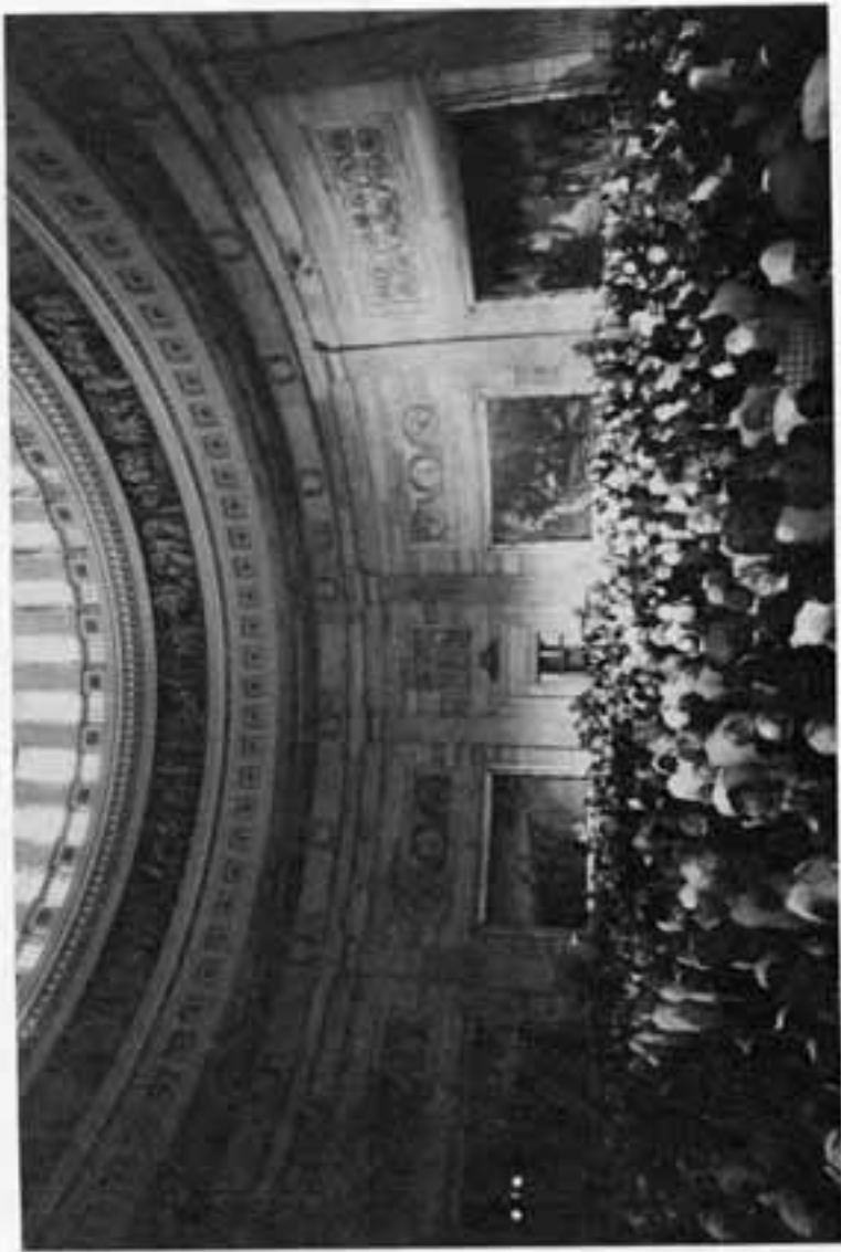
The crowd at the dedication ceremony—U.S. Capitol Rotunda