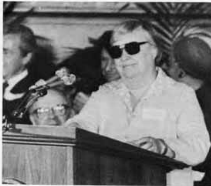
The Honorable Dixy Lee Ray, Governor, State of Washington