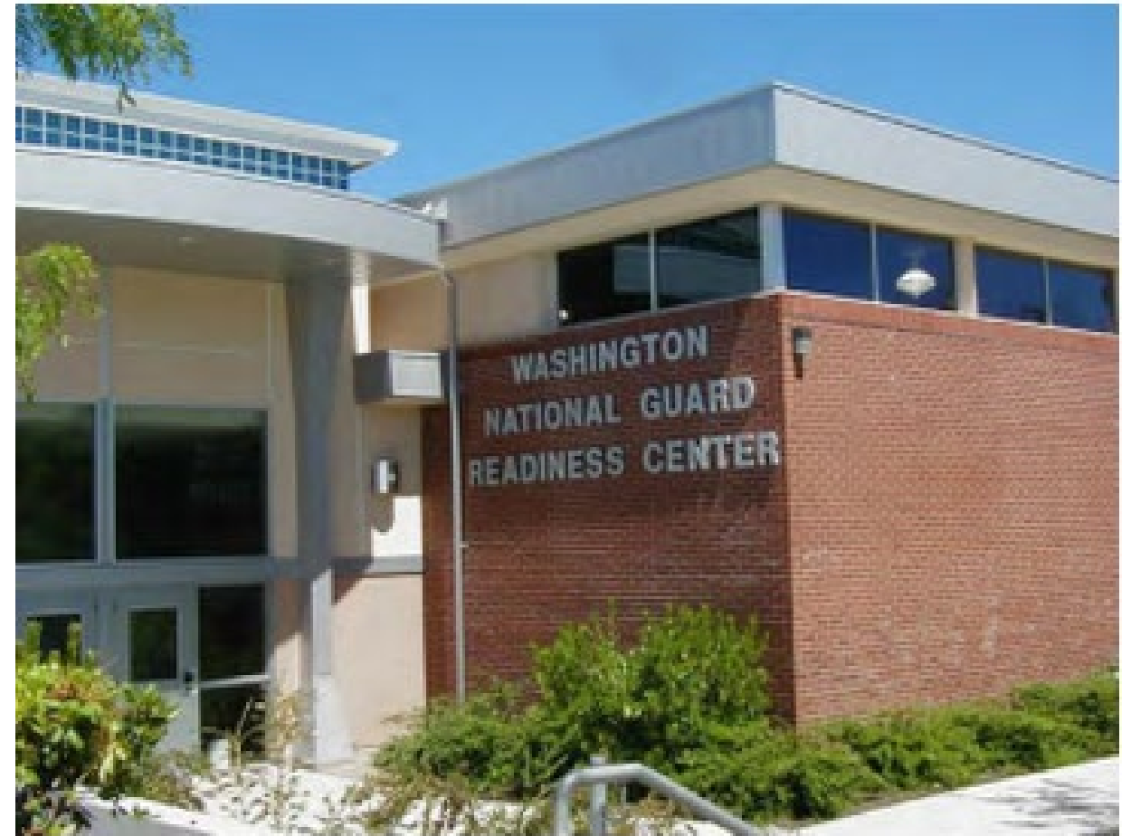
Washington National Guard Readiness Center Anacortes, Washington