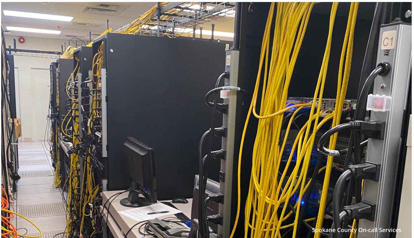
Spokane County On-call Services

Army Corps of Engineers – Seattle District, Fairchild AFB / Seattle, WA